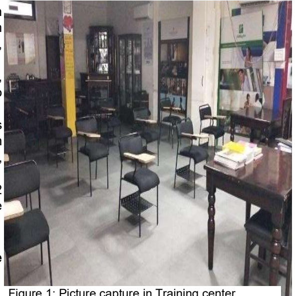
Figure 1: Picture capture in Training center

All the trainees/trainers coming in contact with lab equipment must mandatorily wear hand gloves before touching the equipment. Labs must have abundant Sanitizers for Trainees.