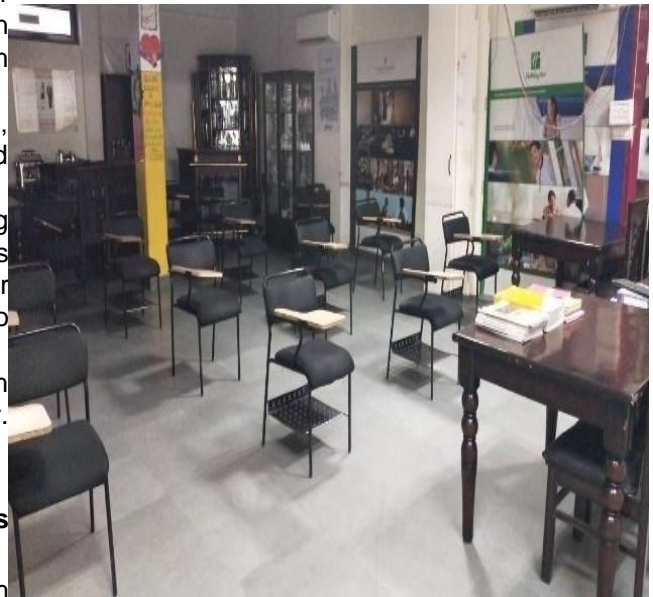
Figure 1: Seat arrangement in a Training center